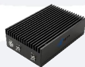
Available 220V System Benchtop Amplifier